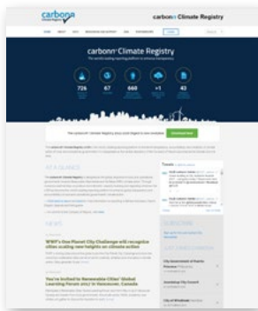
The cCR website

Since the 2017-2018 OPCC has a thematic focus on urban transport and mobility, cities are encouraged to fill in their mobility profile in the "mobility data" tab, within the main reporting sheet, as well as submit any transportation or mobility plan that may have been formulated. Doing so provides context to a city's mobility actions, and is required for a city to be separately recognized for mobility.